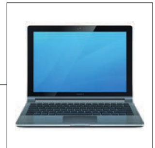
BMS building management system or fire alarm system