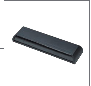
Infra-red sensor part No 41343J