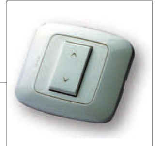
Push button part No 41013B