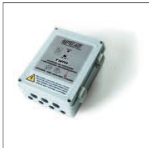
CRM control panel