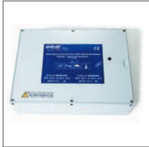
EFC control panel 4-10-20 A